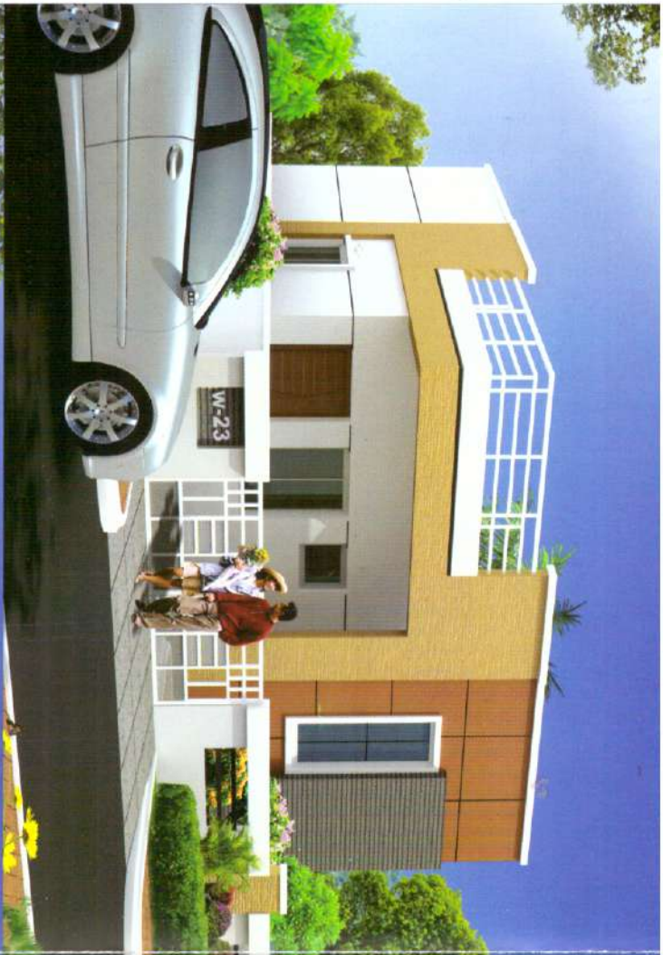
WEST FACING PLAN TYPE C