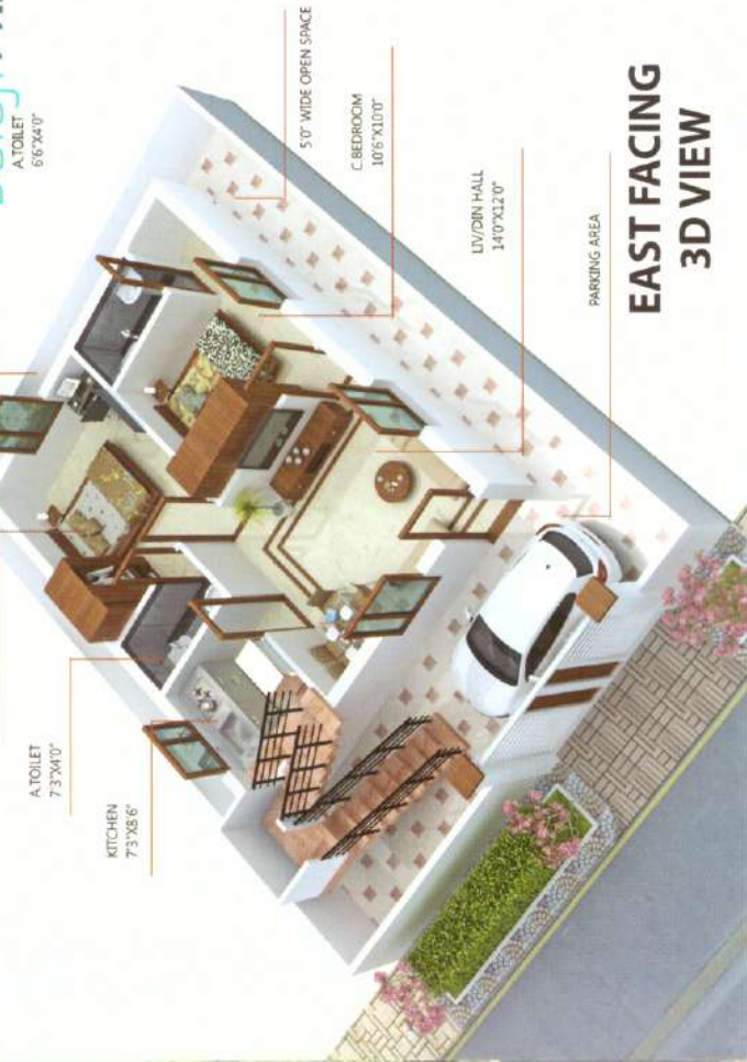
EAST FACING 3D VIEW